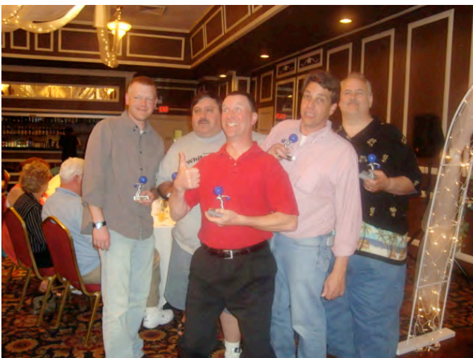
Last Place Bobble Heads Winners!!!!!!