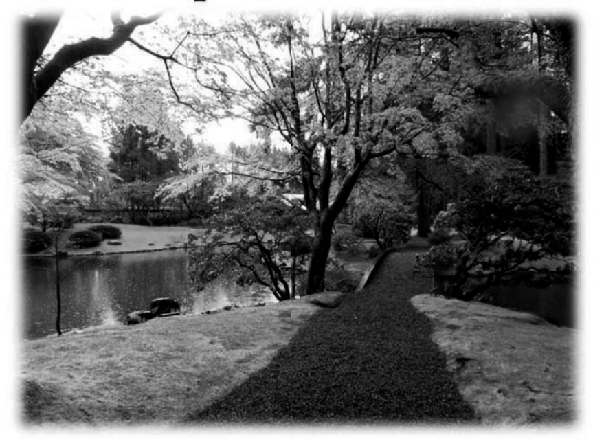
Caribe Royale Orlando, Florida Monday, July 23, 2018 at the hour of 1:30 p.m.