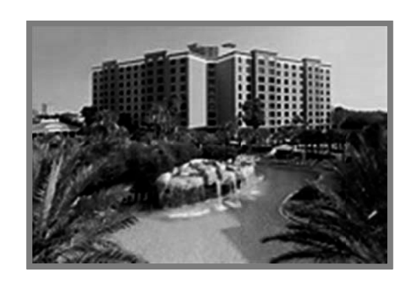
Caribe Royale All Suites Resort Orlando, Florida July 22-26, 2018