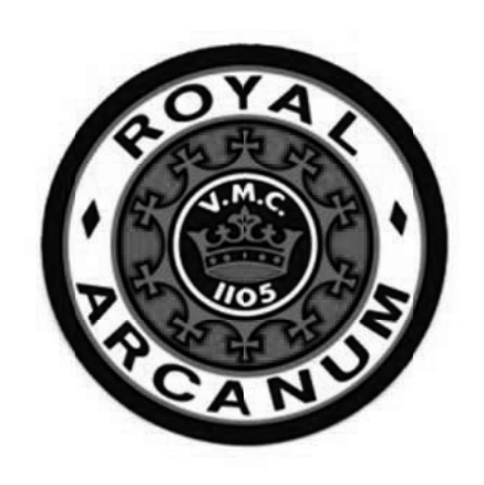
104<sup>th</sup> Supreme Council Session Program of Activities